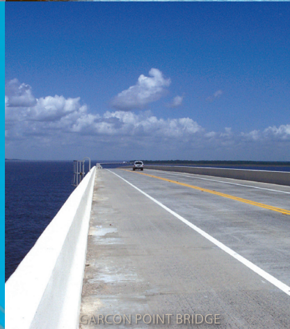
GARCON POINT BRIDGE