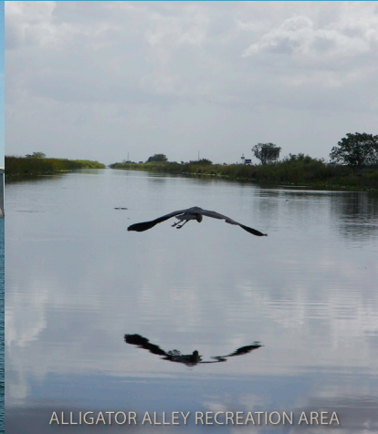
ALLIGATOR ALLEY RECREATION AREA