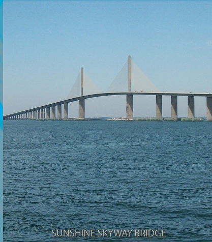
SUNSHINE SKYWAY BRIDGE