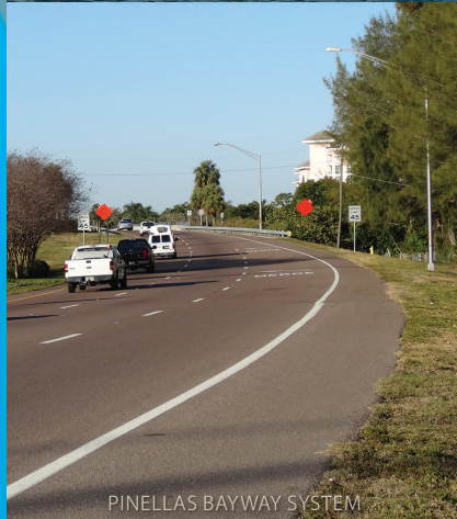
PINELLAS BAYWAY SYSTEM