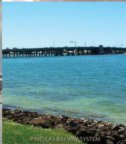
PINELLAS BAYWAY SYSTEM