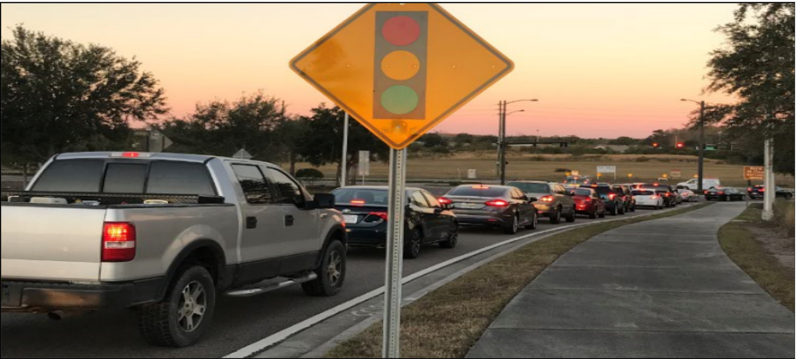
Picture 2: Kissimmee Park Road - Looking East Towards Old Canoe Creek Road (PM Peak)