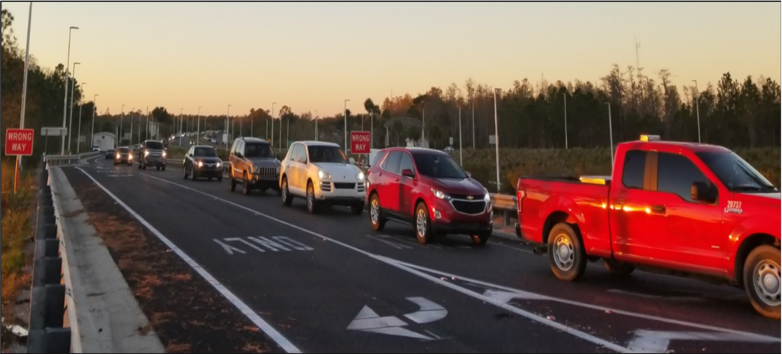
Picture 1: Kissimmee Park Road Southbound Off-ramp - Looking North (PM Peak)