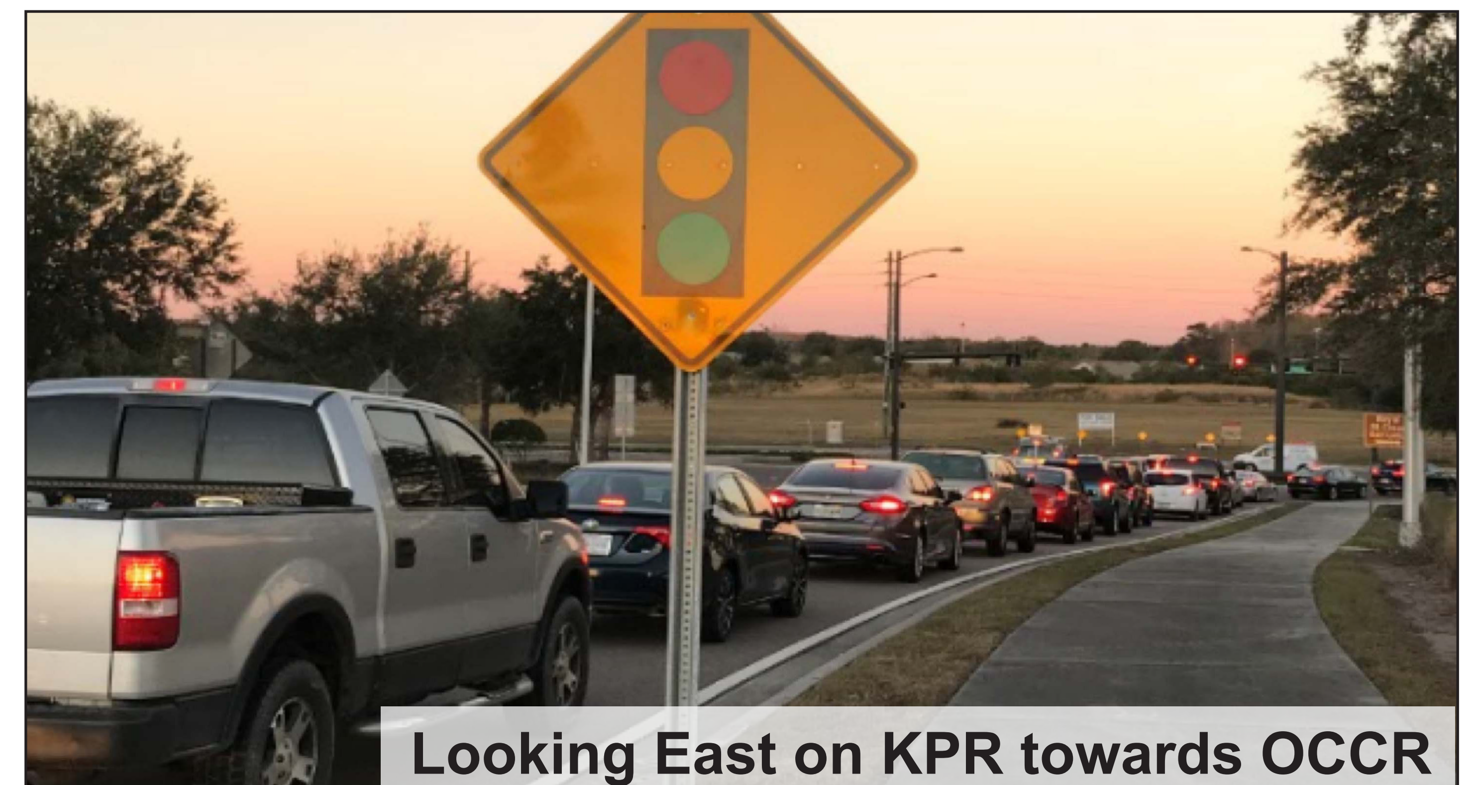
Looking East on KPR towards OCCR