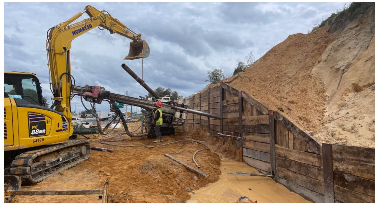
Crews are seen here constructing the new CR 438 bridge

As part of the Florida's Turnpike Enterprise (FTE) construction project widening Florida's Turnpike/State Road (SR) 91 from SR 50/Clermont to Hancock Road/Minneola, FTE is demolishing and replacing the CR 438/Oakland Avenue Bridge in Oakland, Orange County.