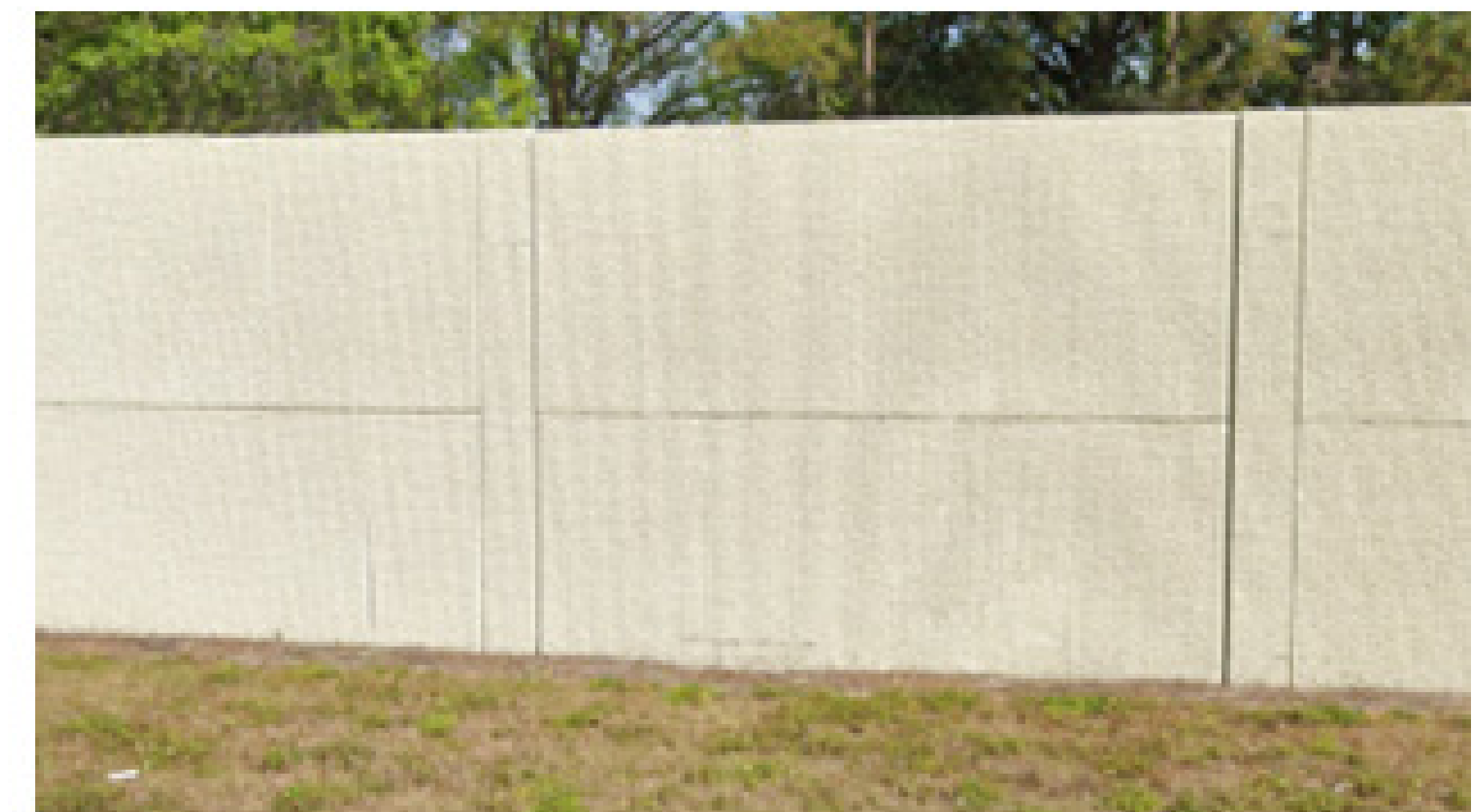
Construct Noise Walls (According to FDOT Criteria)