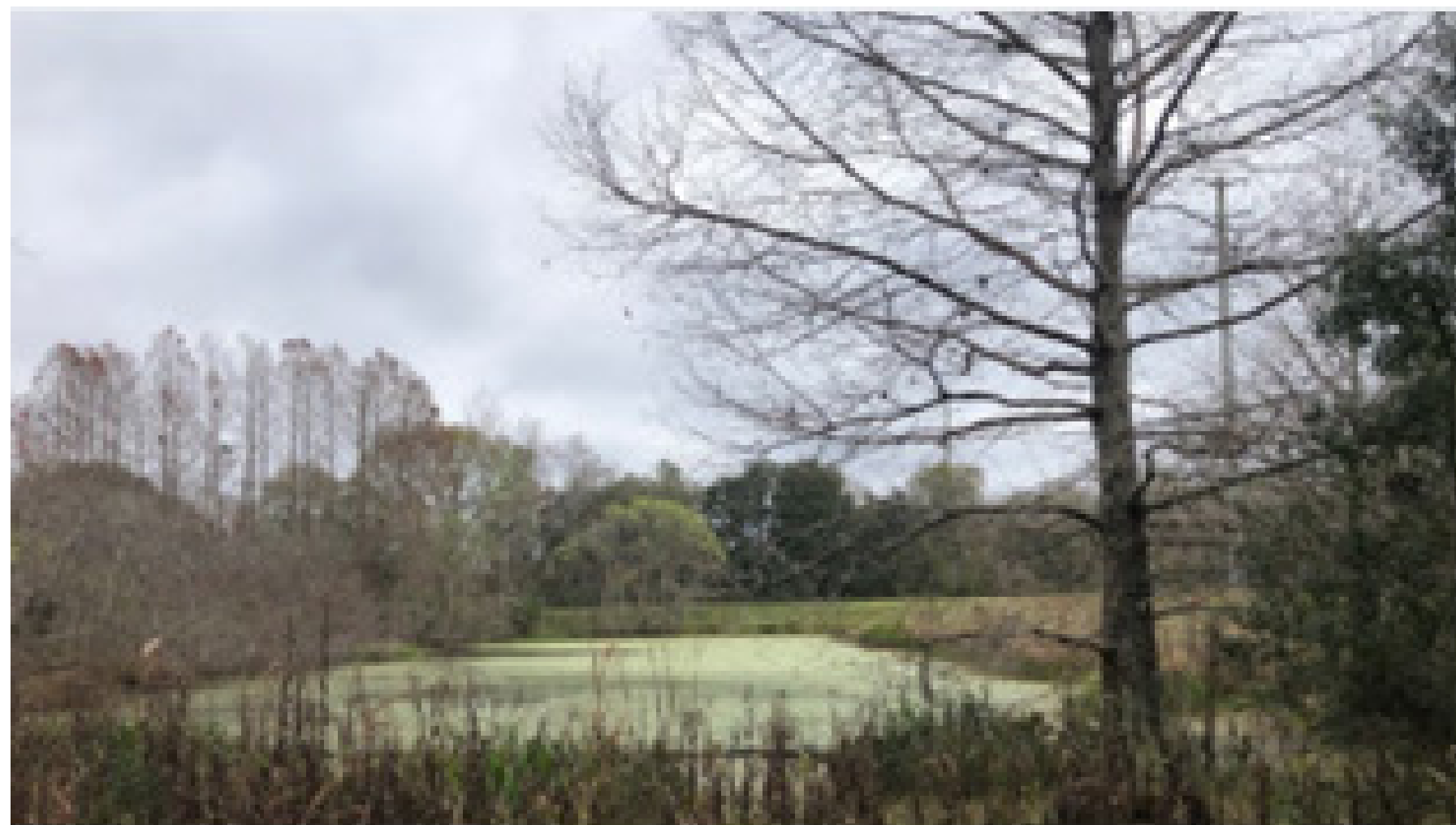
Improve Existing Stormwater Ponds