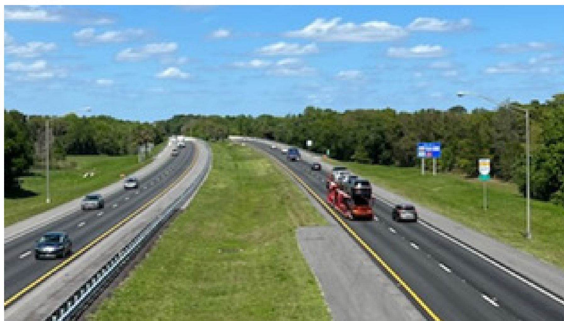
Install Roadway Lighting