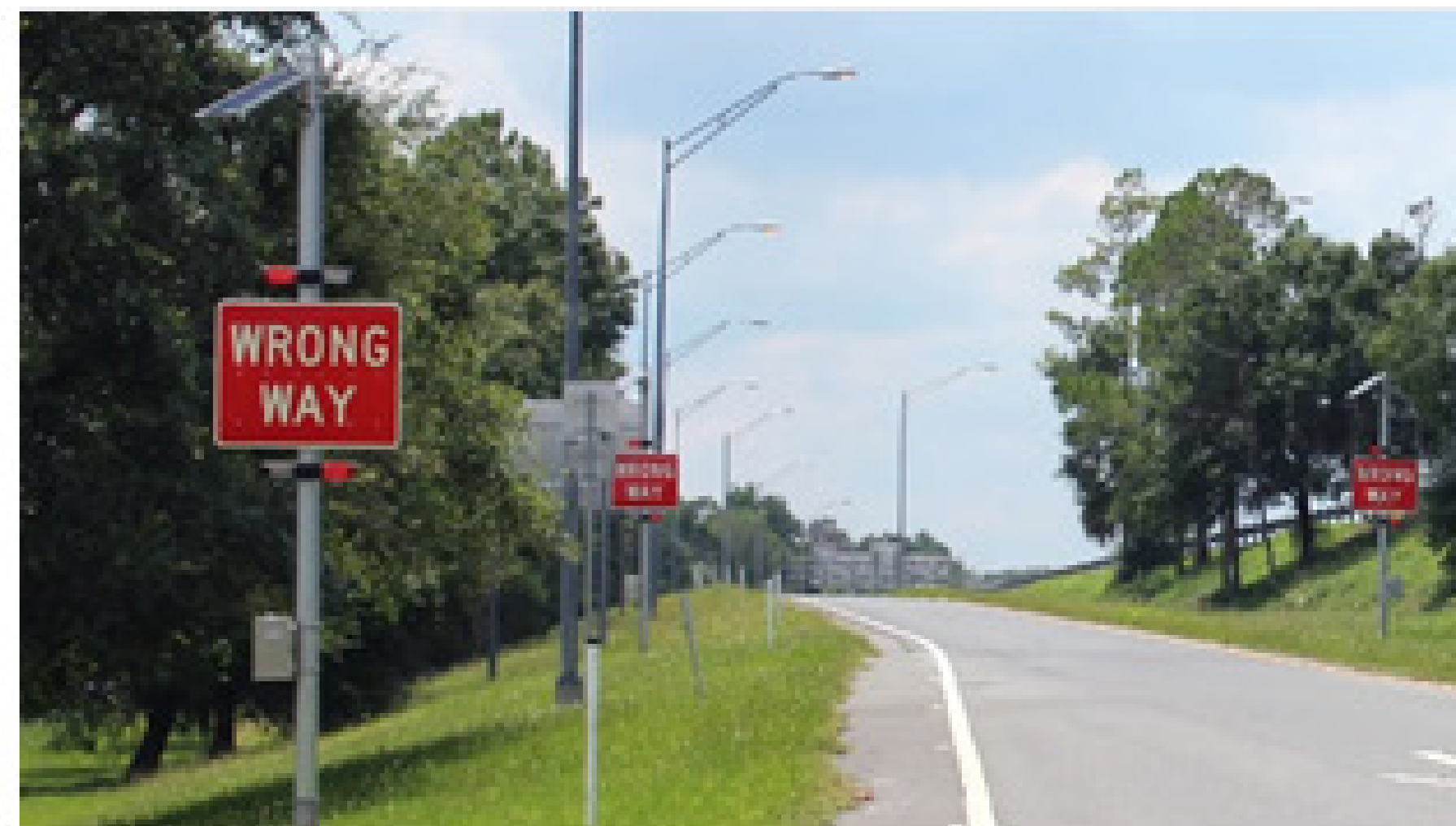
Upgrade Intelligent Transportation Systems (ITS)