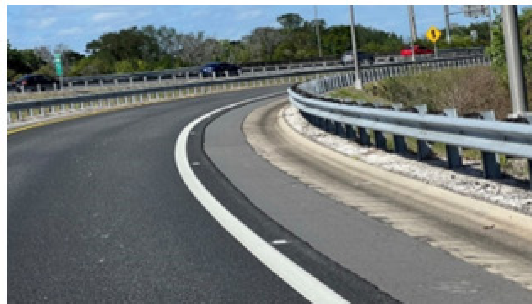
Enhance Roadside Safety