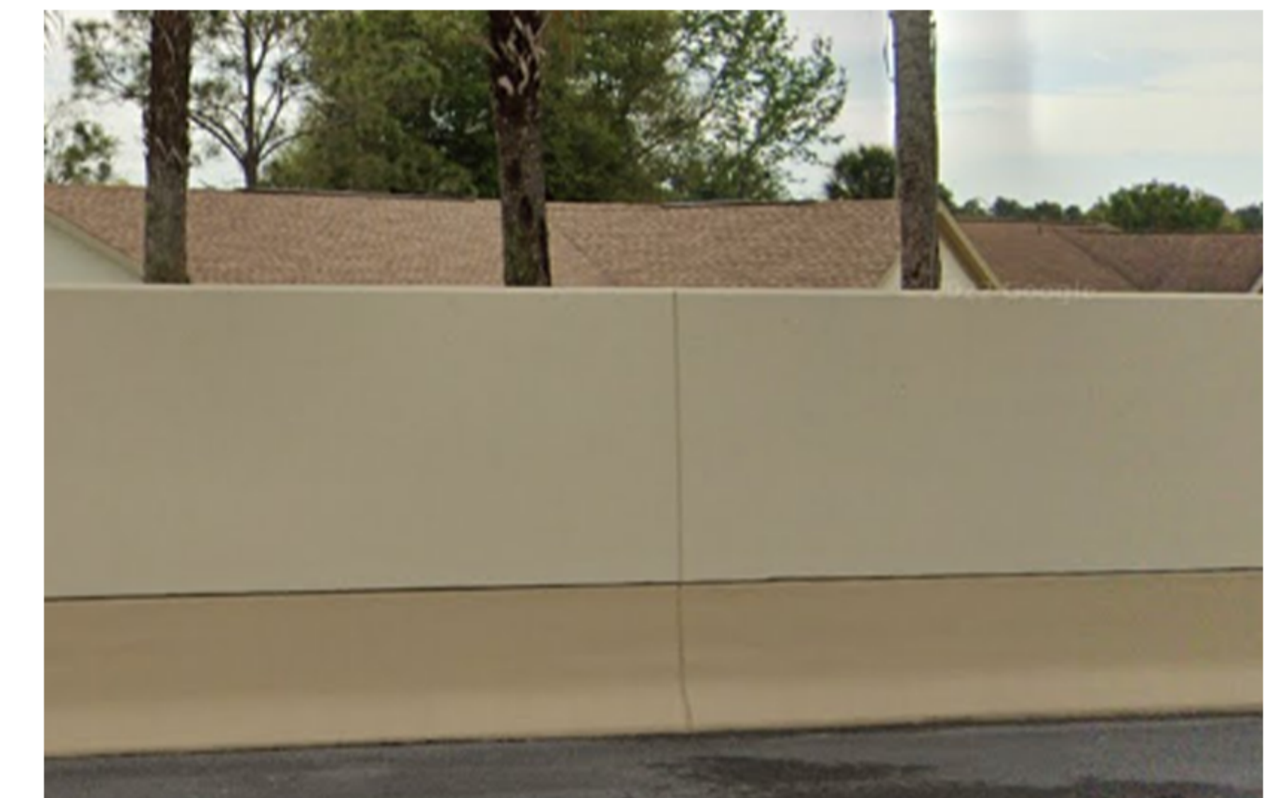
Noise Wall (Example Shoulder Mounted)