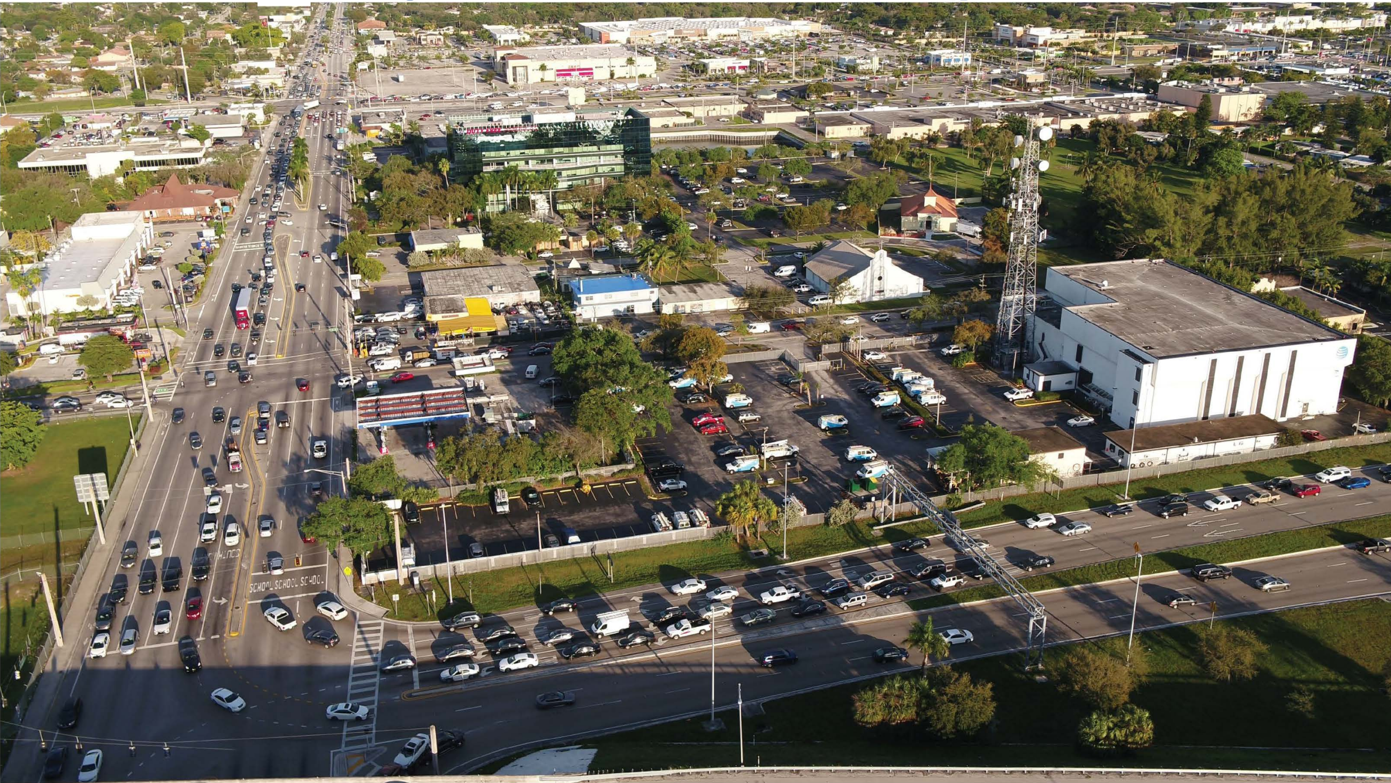
2014 - 2018 CRASHES