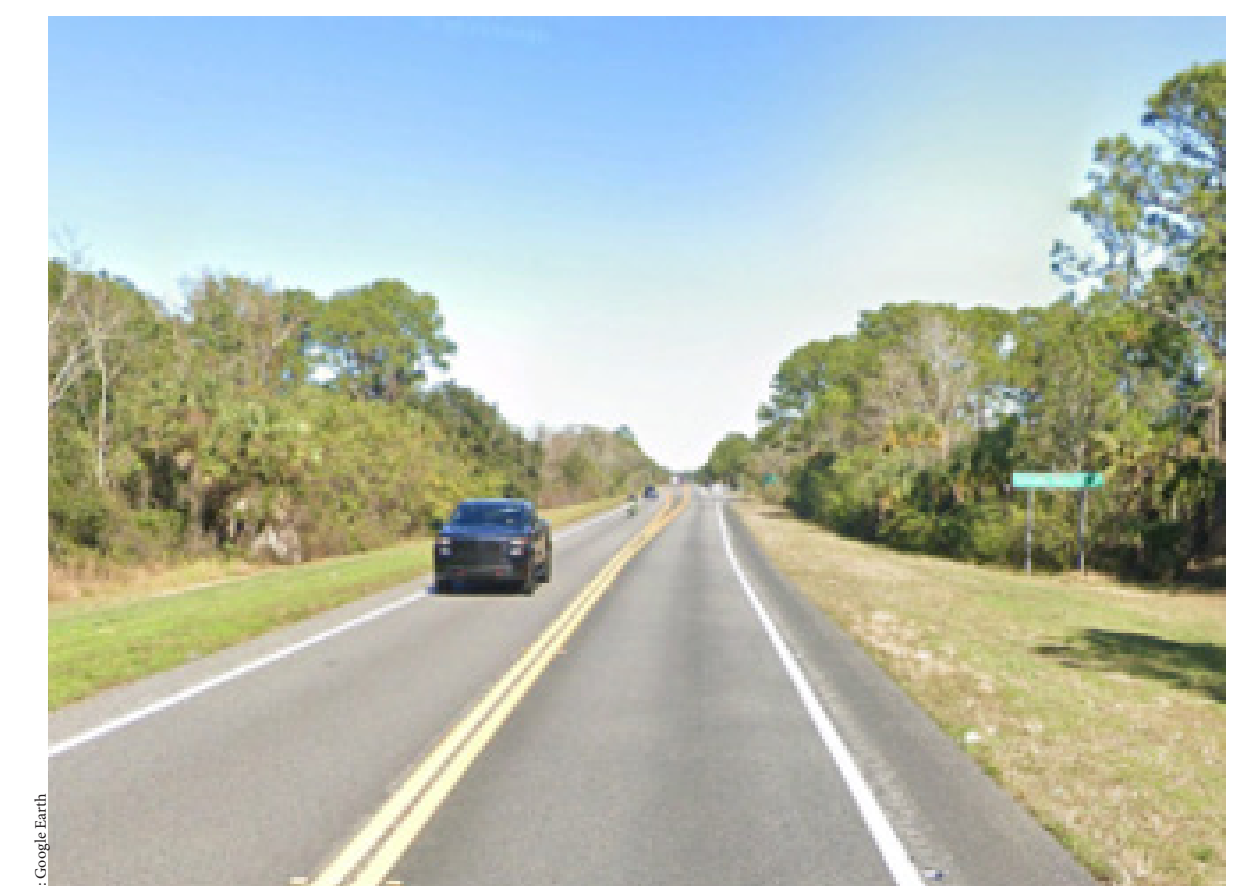
SR 407 facing east near Shepard Drive

Public Information Meeting | Virtual: March 21, 2023, 6:00 PM In Person: March 23, 2023, 5:30 pm – 7:30 pm, Holiday Inn Titusville, 4715 Helen Hauser Boulevard, Titusville, FL 32780