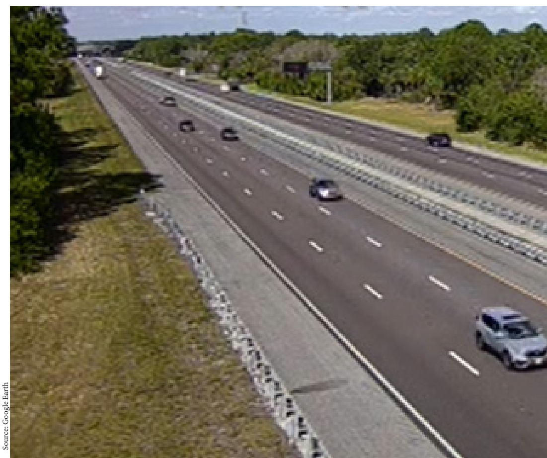
I-95 south of SR 407