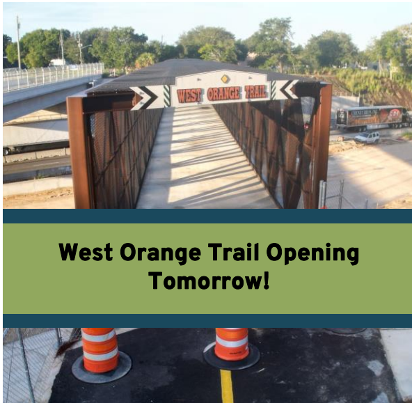
West Orange Trail Opening Tomorrow!

Florida's Turnpike Enterprise is excited to announce the opening of the newly reconstructed West Orange Trail bridge over Florida's Turnpike/State Road (SR) 91 in Orange County at 8 a.m. Thursday, September 28. The bridge was closed last year for reconstruction.