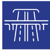
Improve Regional Connectivity