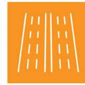
Enhance Safety & Emergency Evacuation