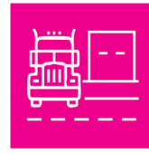
Enhance Freight Mobility & Economic Competitiveness