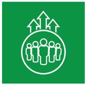
Accommodate Transportation Demand (Year 2050)

A project's purpose and need are the reasons why the project is necessary and serves as the basis for identifying reasonable alternatives. The needs for the Central Polk Parkway East project established in 2011 by FDOT District 1 are still valid and have been updated based on current and forecasted transportation deficiencies. The project needs include accommodating Year 2050 transportation demand, improving regional connectivity, enhancing freight mobility & economic competitiveness, and enhancing safety and emergency evacuation.