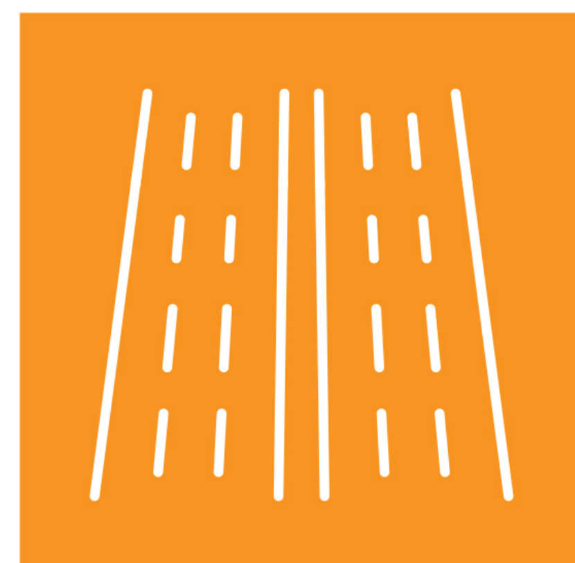
Enhance Safety & Emergency Evacuation