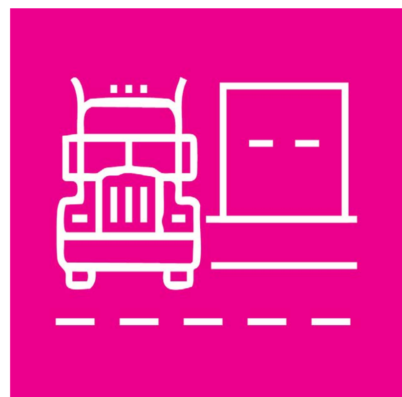
Enhance Freight Mobility & Economic Competitiveness