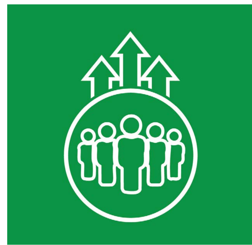
Accommodate Transportation Demand