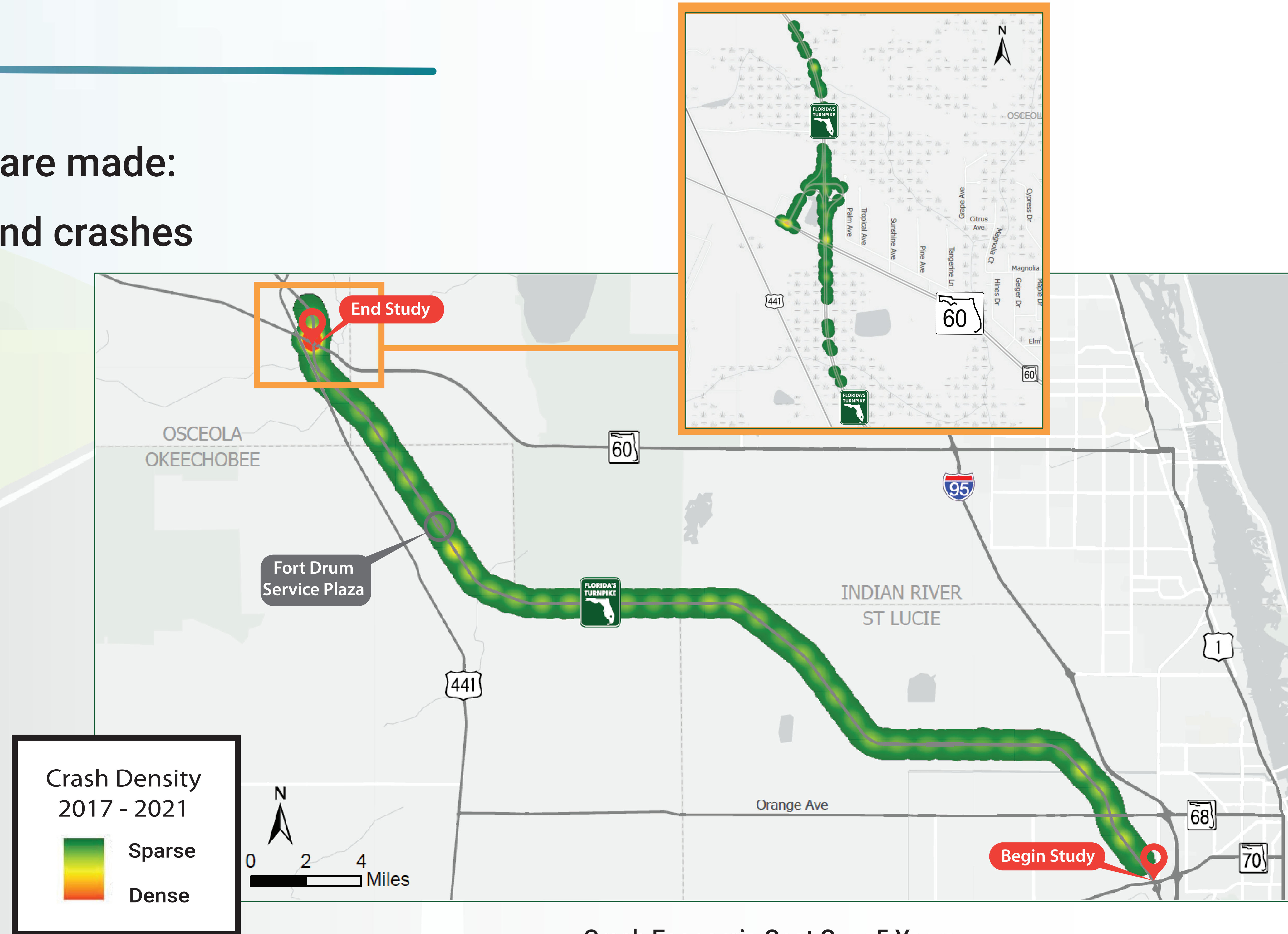
Crash Economic Cost Over 5 Years