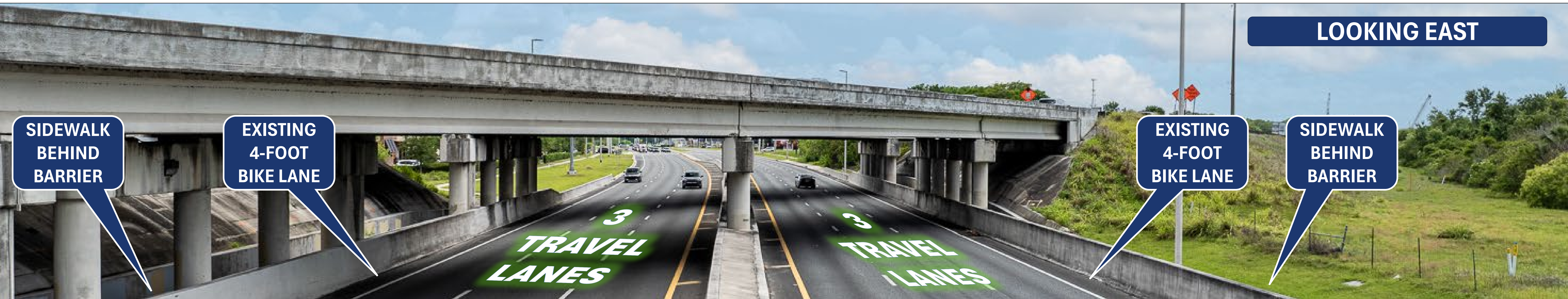
EXISTING TYPICAL SECTION